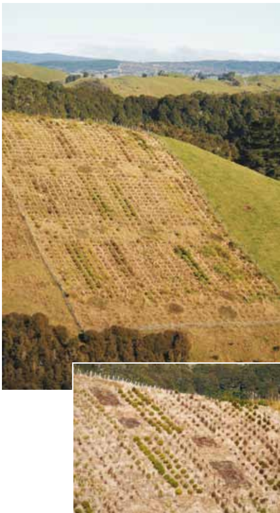
Planting trial on a retired steep hill slope at Waihaha, western Taupo, 2 years after planting comparing the 3 nursery methods – open ground, pots, root trainers. Note the 3-tree rows for each species as part of the randomised complete block design (inset).