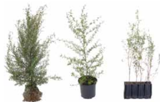
Dissimilar siblings—although grown from the same seed source and germinated at the same time, because open-ground, pot and root trainer plants, progressively, have less room for canopy and root development, their respective sizes at planting differ markedly (see Technical Article 5.3).

Although some planter bag plants were used in the trials, for simplicity here both planter bags and pots are mostly referred to as pots.